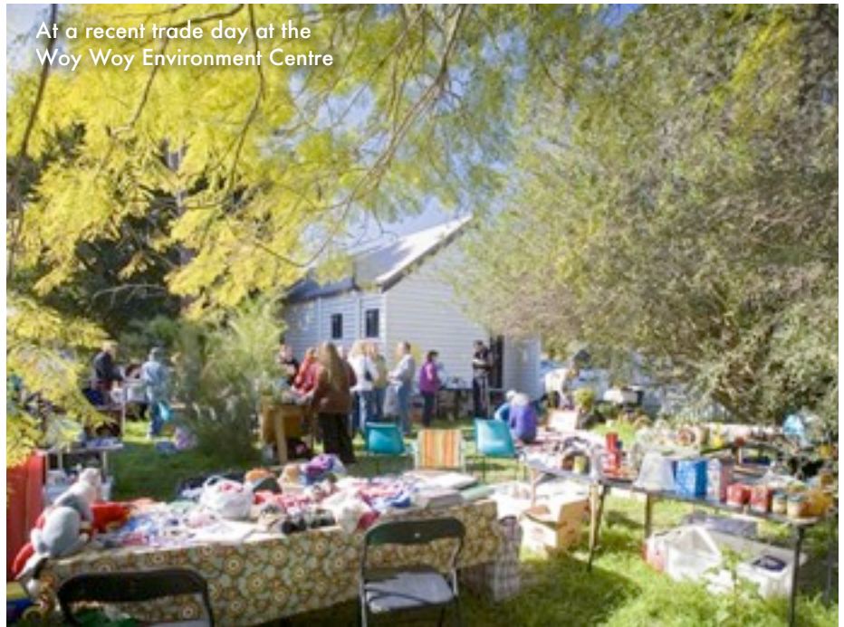
At a recent trade day at the Woy Woy Environment Centre