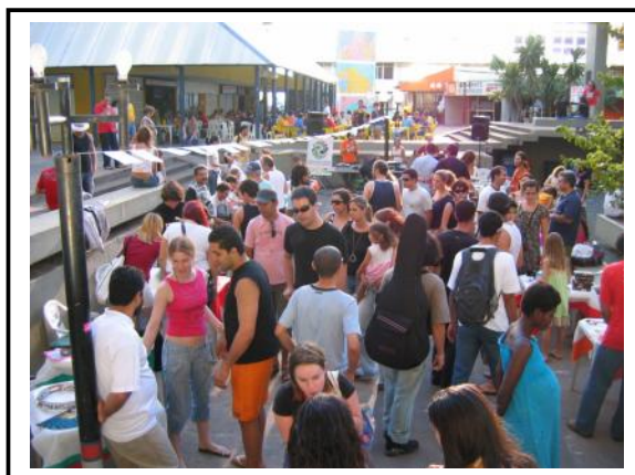
Escambau, a LETS Market organized by a social group in Brasilia.

Hello to LETS members, my extended Maleny family.