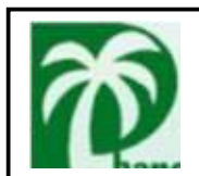
Banco Palmas, Ceara - Northeast Brazil.